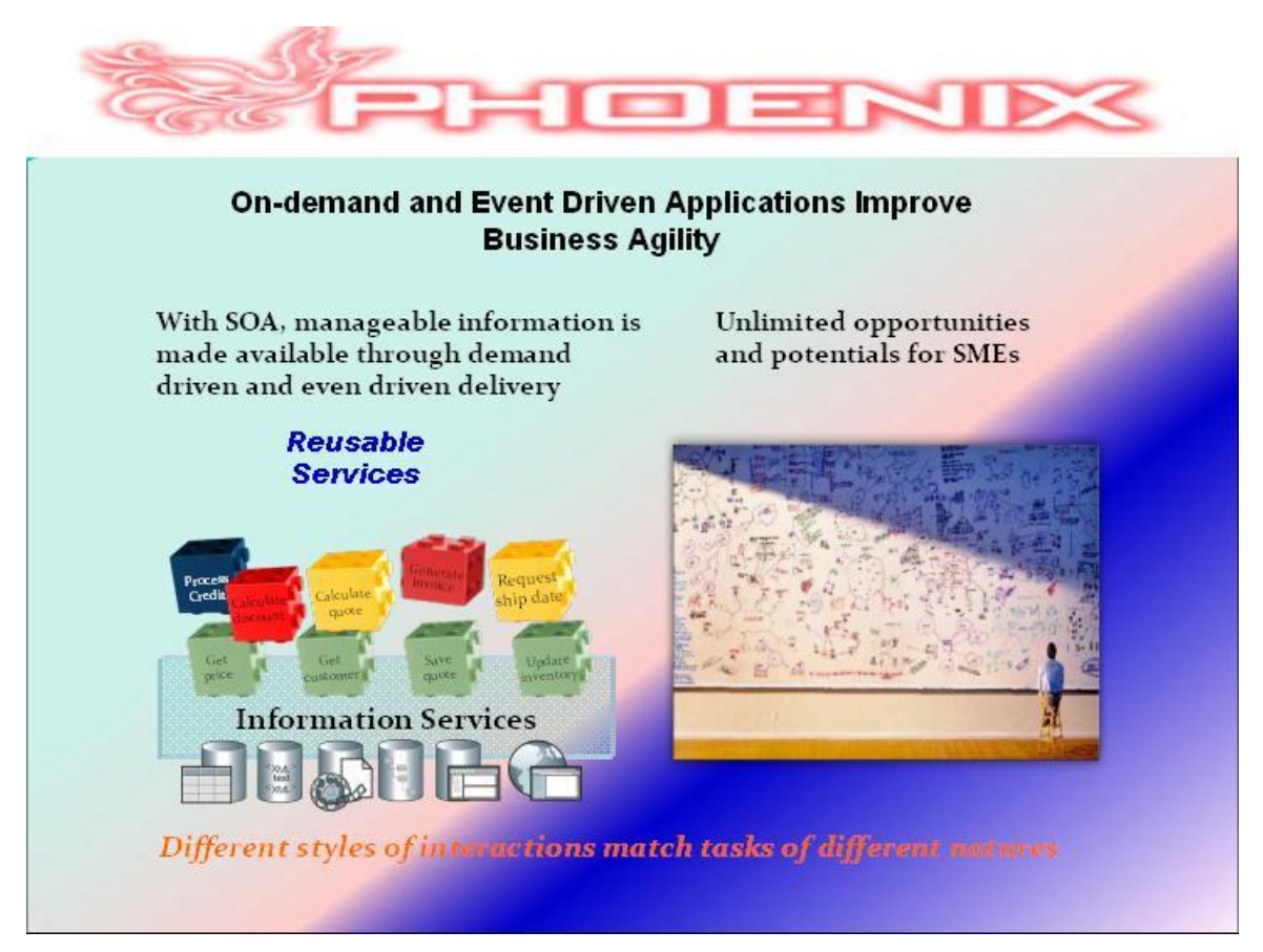
Fig. 3: Improved business agility through flexible services delivery.

To engage SME users with the modern services oriented framework, two styles of interactions i.e. demand driven and event driven as shown in Figure 3 are recommended and discussed below.